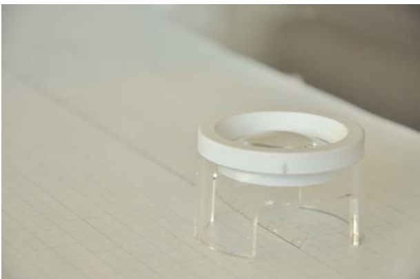
"The outline of the moon" Hitosugi WATANABE