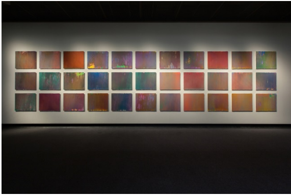
Hundred Layers of Colors 75×90cm×33pieces silkscreen 2014