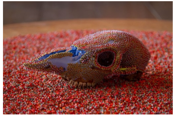
Rinzu, skull,oily ink 2010