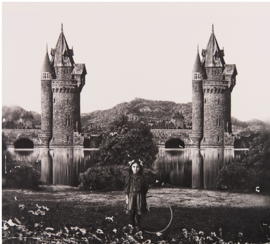
Rondo5, 2017, pencil on paper, 110.0 × 150.0cm

"Rondo 5" by pencil on paper and oil paintings based on ukiyo-e are also on exhibition. We will understand the pluralistic nature of the world through his works and rethink the existence of the world. We are looking forward to your visit.