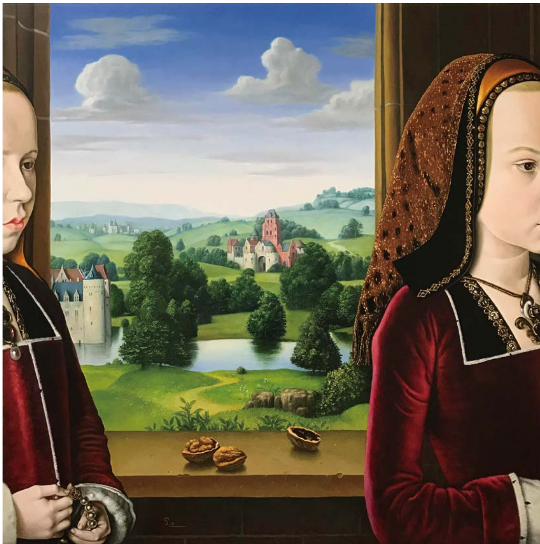
Margaret of Austria, 2018, oil on canvas, 60.0×60.0cm