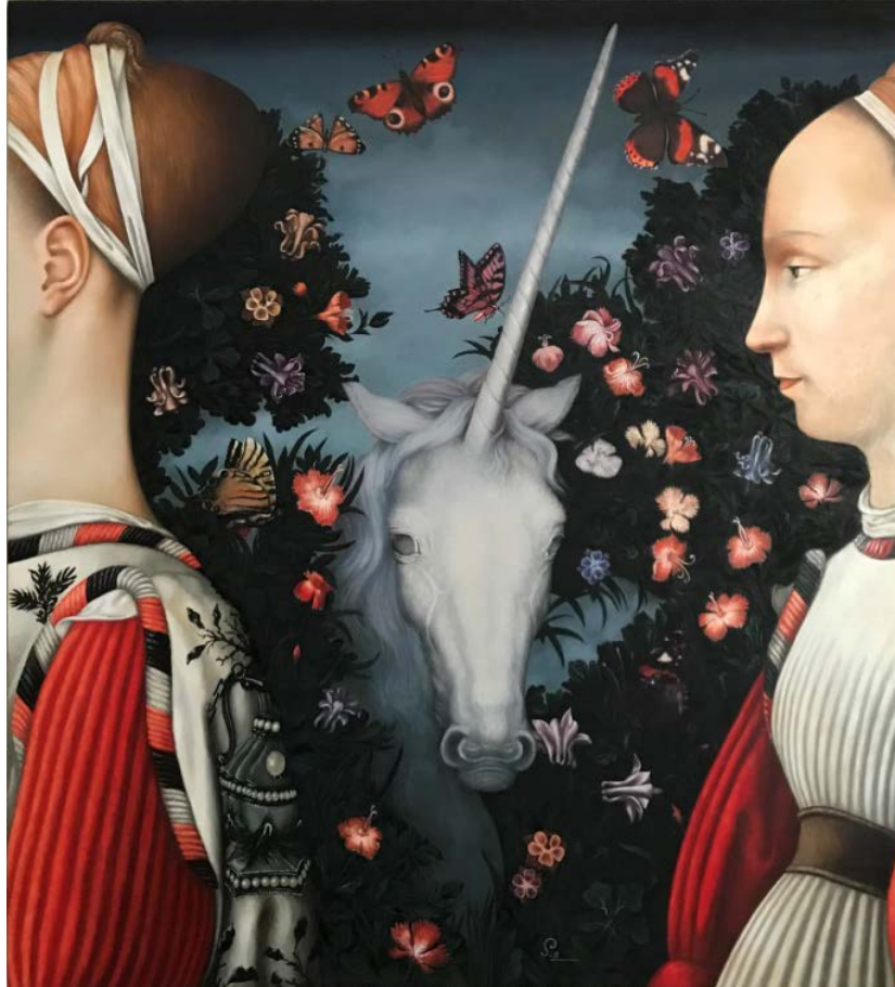
Princess of the House of Este and a Unicorn, 2018, oil on canvas, 55.0 × 50.0cm